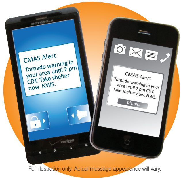
For illustration only. Actual message appearance will vary.

The alerts will tell you the type of warning, the affected area, and the duration. You'll need to turn to other sources, such as television or your NOAA All-Hazards radio, to get more detailed information about what is happening and what actions you should take.